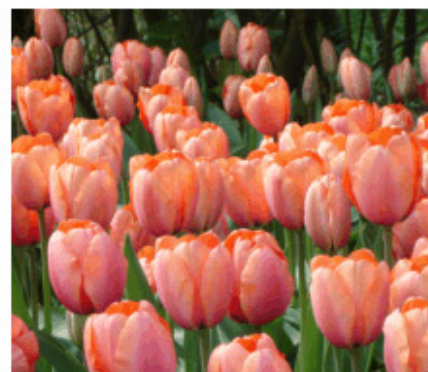
APRICOT IMPRESSION 22" Mid-Spring