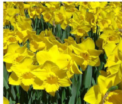
DUTCHMASTER 16" Early-Mid-Spring