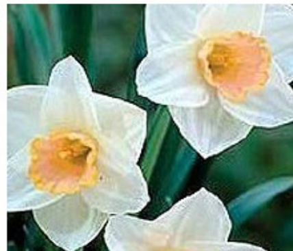
SALOME 14" Late Spring