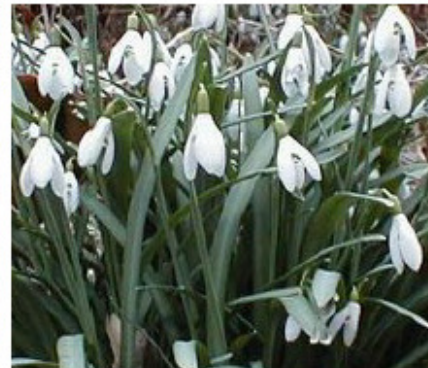
SNOWDROPS 4-6" Early Spring