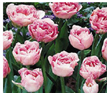
ANGELIQUE 18" Late Spring