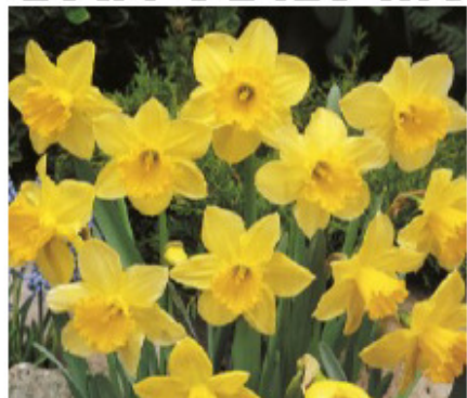
CARLTON 14" Early-Mid-Spring