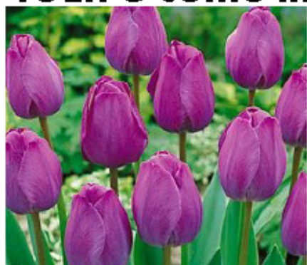
ATTILA 20" Mid-Spring