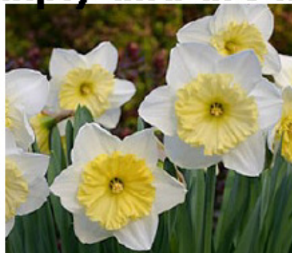
ICE FOLLIES 14" Early Spring