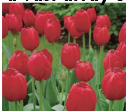
RED IMPRESSION 22" Mid-Spring