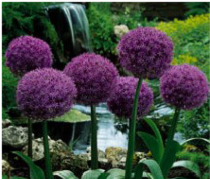
A. GLOBEMASTER 30" Early Summer