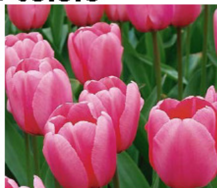
PINK IMPRESSION 22" Mid-Spring