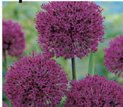
A. PURPLE SENSATION 20" Early Summer