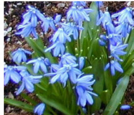
SCILLA 5" Early Spring