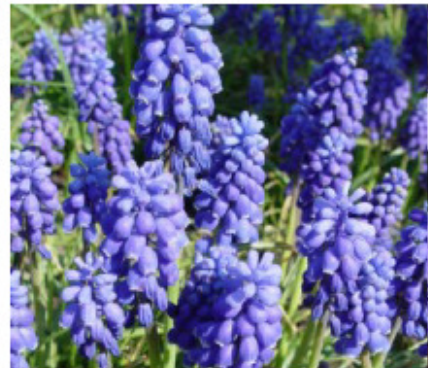
MUSCARI 4-8" Mid-Spring