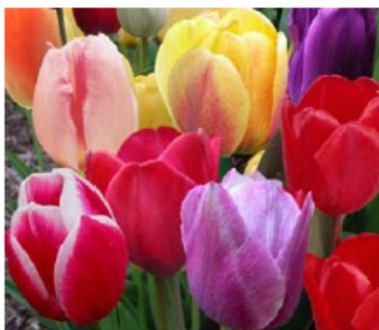
MIXED TRIUMPH 12-24" Mid-Spring