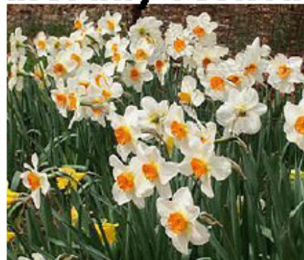
BARRETT BROWNING 16" Early-Mid-Spring