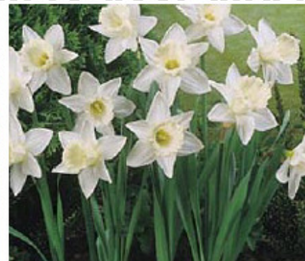
MOUNT HOOD 14" Mid-Spring