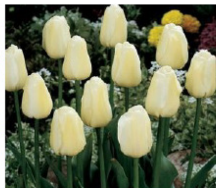
IVORY FLORADALE 22" Mid-Late Spring