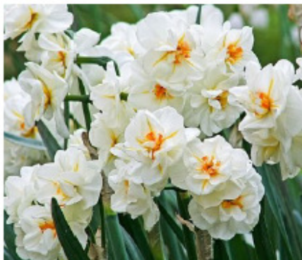
SIR W. CHURCHILL 15" Mid-Spring