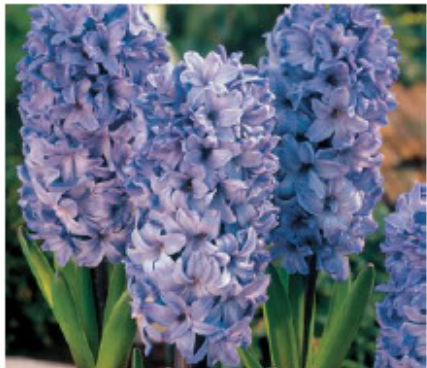
H. DELFT BLUE 10" Late Spring